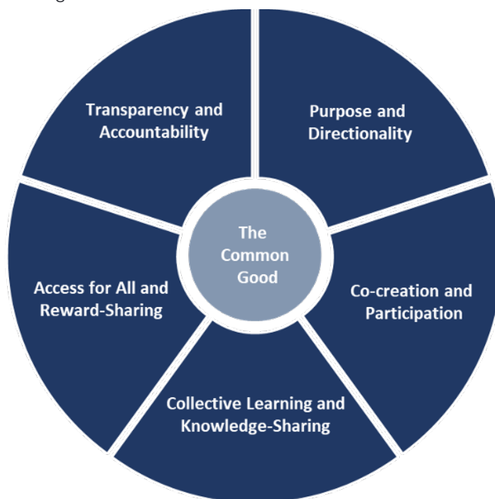
Figure 2. The common good

A revived approach to the common good, posited as a collective objective rather than a correction, focuses as much on the ‘how’ as the ‘what’. It can be guided by a market-shaping view of government, driven by public value. The first pillar, purpose and directionality , can promote outcomes-oriented policies that are in the common interest. The second pillar, co-creation and participation , allows citizens and stakeholders to participate in debate, discussion and consensus-building that bring different voices to the table. The third pillar, collective learning and knowledge-sharing , can help design true purpose-oriented partnerships that drive collective intelligence and sharing of knowledge. The fourth pillar, access for all and reward-sharing , can be a way to share the benefits of innovation and investment with all the risk takers, whether through equity schemes, royalties, pricing or collective funds. The fifth pillar, transparency and accountability , can ensure public legitimacy and engagement by enforcing commitments amongst all actors and by aligning on evaluation mechanisms.